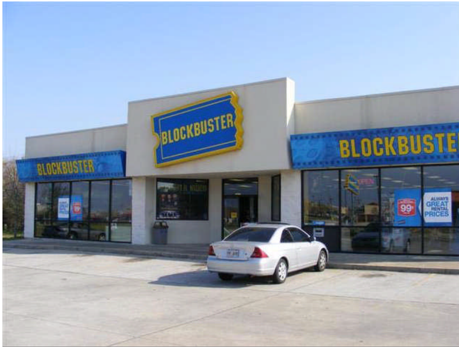
1. Front elevation which faces north