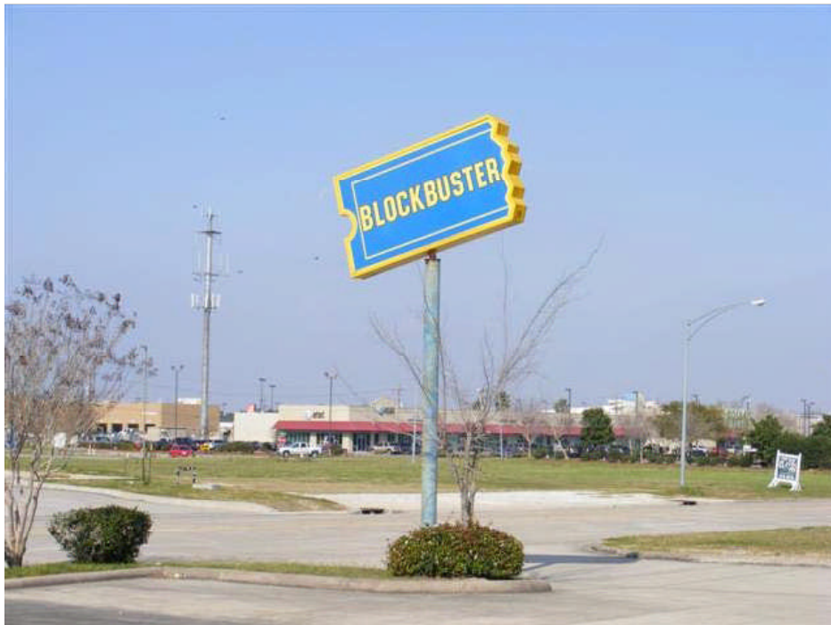
2. Primary signage