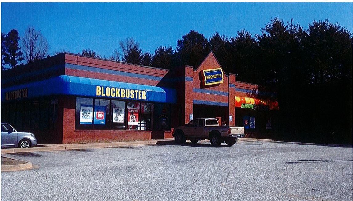
Photograph 2: Front entrance.