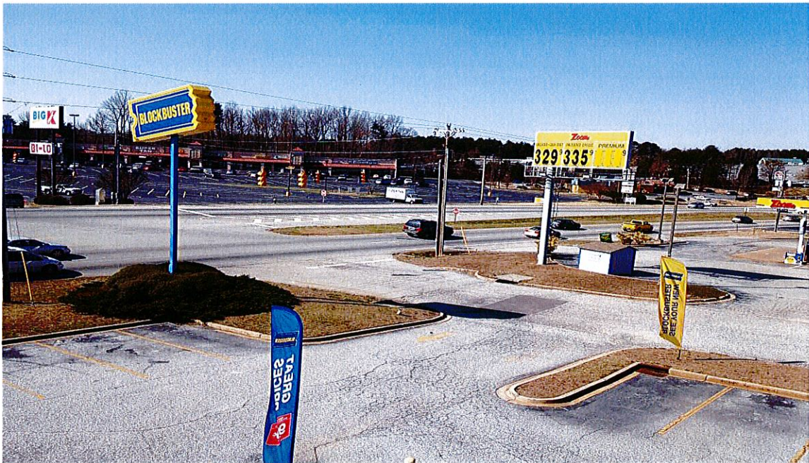
Photograph 1: Main signage.